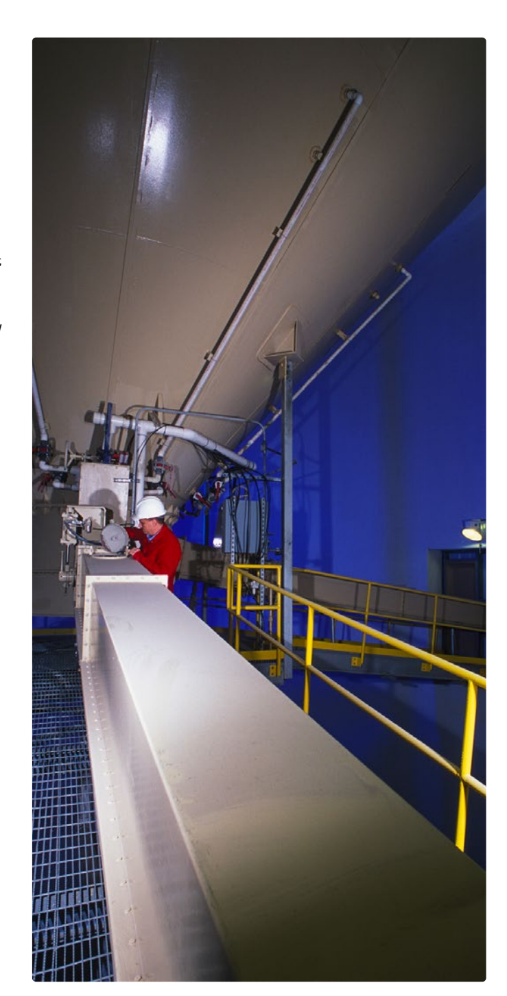
Airslide® gravity conveyor